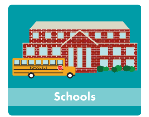
Schools (K-12, college and vocational schools)