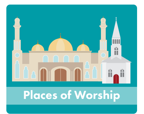
Places of worship or buildings rented for religious services